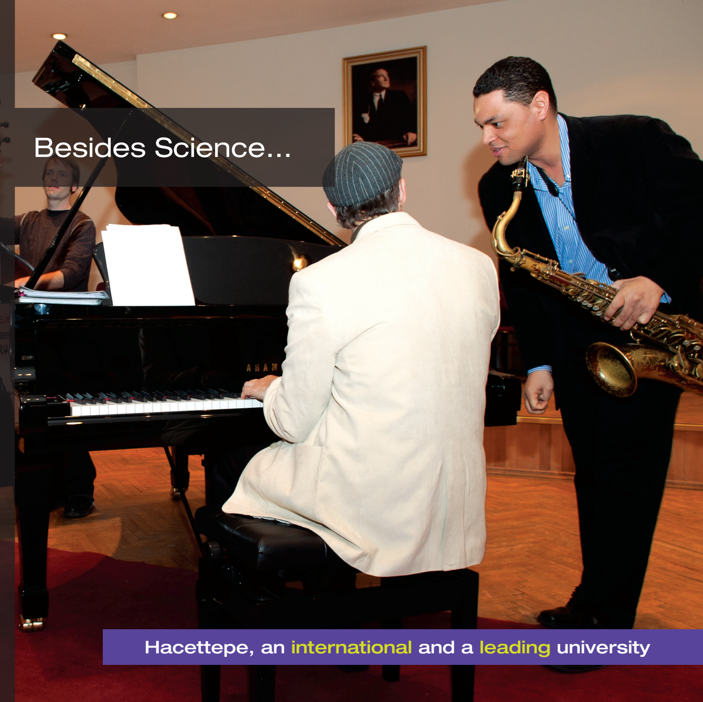
Photo: Hacettepe University Ankara State Conservatory, Music Department, Jazz Division, Workshop...

With the help of elective courses like Communication, Plastic Arts, Photography, Cinema-TV, Turkish Folk Dances, Turkish Folk Music, Turkish Classical Music, Theatre and Diction, we encourage students to diversify their interests and gain experience that is not limited solely to theoretical education.